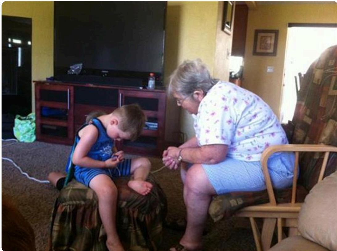
Great Grandma with Hudson